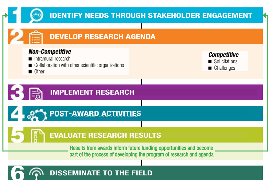
Figure 3. The NIJ's R&D process

The NIJ's Office of Investigative and Forensic Sciences (OIFS) is the federal government's principal agency for forensic science research and development. OIFS's activities include supporting research and development, technology transition, and capacity building and technical assistance. NIJ funds research and development to provide objective, independent, evidence-based knowledge and tools to meet the challenges within the criminal justice system, particularly at the state and local levels. Funding is available to all forensic disciplines, including forensic pathology. Figure 3 provides the basic steps of the NIJ's R&D process for evaluating research for funding. This funding can support personnel, travel (to execute research or dissemination), supplies, equipment, subcontracts to partnering agencies, consultants, and tuition.