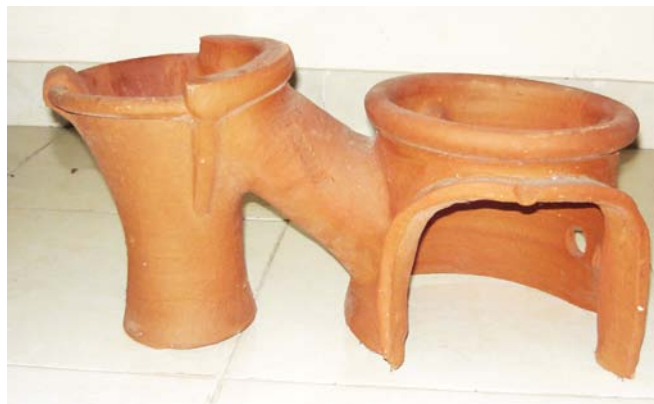
Figure 4. An Anagi stove is a commercialized model offering convenience features

Nevertheless, these programs to foster improved technologies remain small. Consequently, to accurately characterize the degree of improvement and inform interventions for the optimal stove technologies, a comprehensive evaluation of the health and environmental impact of improved stoves is needed.