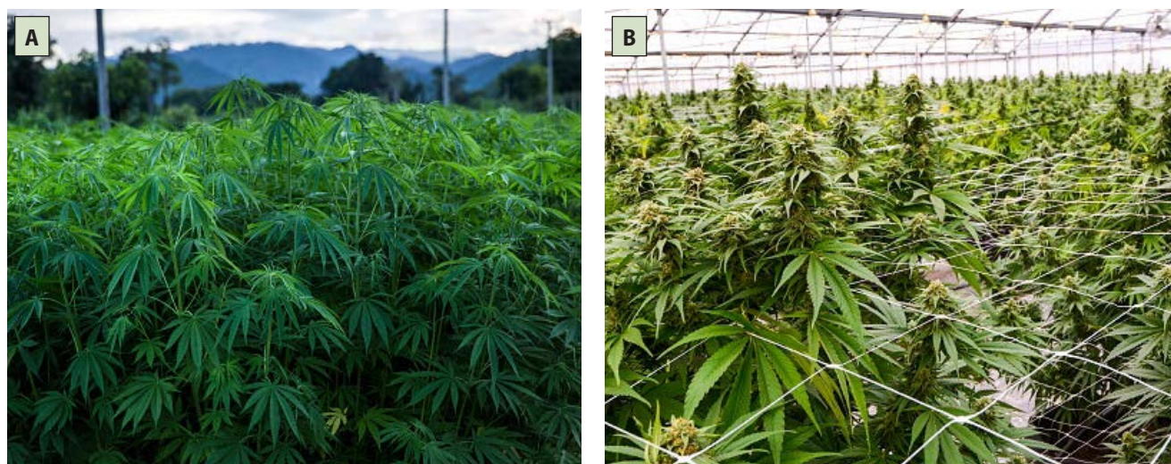
Figure 3. Comparison of “hemp” and “marijuana” strains of cannabis plants

Note: The industrial “hemp” strain of cannabis (panel A) is taller and has more fibrous stalks with thinner leaves. It is typically cultivated outdoors. The “marijuana” strain of cannabis (panel B) is characterized by its resin-rich flowers and is often cultivated indoors under strictly controlled light and temperature conditions.