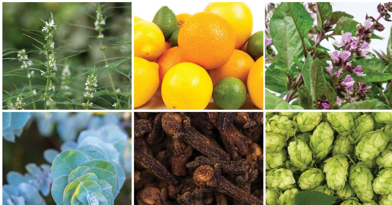
Figure 1. Terpene-containing plants and foods

Note: Besides cannabis, many other plants and foods contain terpenes, including those pictured here. Top row (l-r): Cannabis sativa , citrus fruits, spicy grass basil. Bottom row (l-r): eucalyptus leaves, cloves, beer hops.